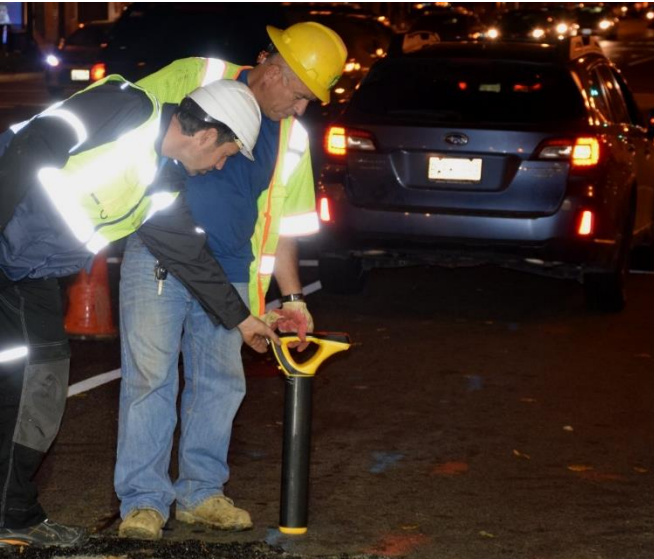
Confirming tracking receiver locates pipe and MTA device

The catching net was pulled back into the retrieval sluice and the valve below the sluice was closed to disconnect the sluice from the main pipe. By slightly opening the top flange, the pressure inside the sluice was released and the inspection device was taken out for downloading the inspection data.