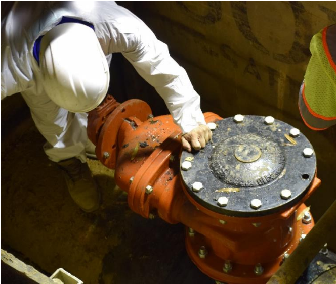
Start access sluice valve installed by DC Water forces