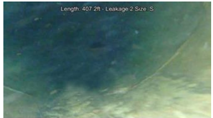
Caught on video - synchronized audio/visual reveals leak location

The second leak, while being rated as larger, yet overall considered to be small, was further down along the pressure pipe. This location was almost equidistant between a branch on one side, and two branch tee connections running perpendicularly in both directions.