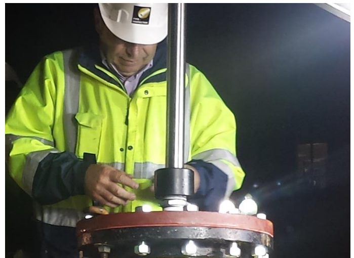
Plunging sleeve connection typical at both access points

The retrieval sluice was attached at the valve at the end extraction access location. It was utilized to insert a retrieval net which covered the complete main pipe inside diameter to catch the MTA Pipe-Inspector tool. Before the assembling of the retrieval sluice and retrieval system, all components of the catching net were disinfected with a liquid disinfectant.