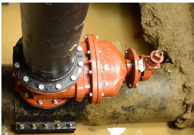
Retrieval access sluice valve installed with riser piece