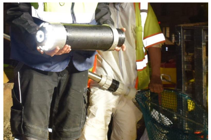
MTA Pipe-Inspector DN125 continues to operate after extraction until turned off and on-board data extracted to computer for immediate video review and data analysis

DC Water is continuing cable-less video inspections of more segments of their aged cast iron water pipes using the MTA Pipe-Inspector in 2018. The data will be used by engineers to provide an existing condition based asset management evaluation for further remedial actions, based on multiple sources of pipe operational conditions.